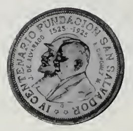
Lot No. 2459

20 Colones, 1925 MO. 500th Anniversary of the founding of El Salvador. Obv. Arms. Rv. Conjoint busts of Alvarado and Quiñonez. KM 132. Only 100 pieces struck. A few light and 2459 unimportant marks. A lovely, prooflike specimen. Brilliant Uncircualted and rare.